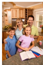
help my family