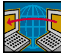
use the internet