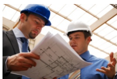
get a job