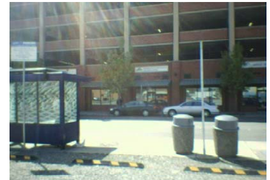
Parking area and bus stop across the street from the BAT examination facility at Auburn Center. (The entrance to the BAT examination facility is directly across the street behind the two parked cars.)