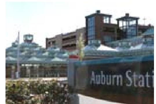
Sound Transit Auburn Station (Sounder train).

Days Inn 1521 D Street N. E. - Auburn (916) 531-0907