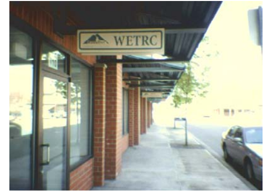
Entrance to the BAT examination facility at Auburn Center.

The Backflow Assembly Tester examination facility is located on the ground floor of the Sound Transit Auburn Station parking garage. There is a large sign that reads “WETRC” displayed in front of the glass door entrance; the entrance is visible from the street. A parking lot and bus stop are conveniently located directly across the street from the facility. Permit parking is available to you at no cost.