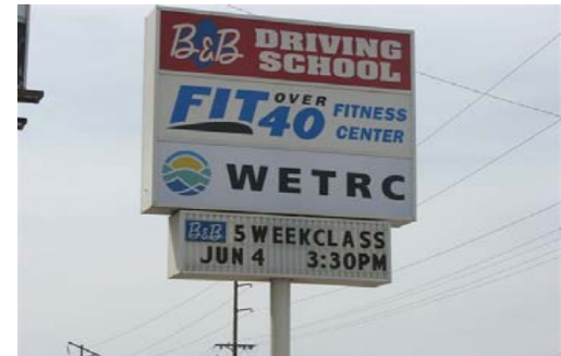
The property sign identifying the Spokane facility is visible from Sullivan Road. The facility is located in a mini-strip mall and is shared with WETRC.