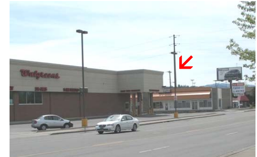
The BAT Exam Facility is located at 125 Sullivan Road, behind the Walgreen's Drug Store.