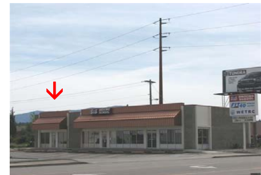
For visual help in locating the building, adjacent businesses include B&B Driving School and Fit Over 40 Fitness Center. These businesses are also listed on the mini-strip mall sign.

Best Western Pheasant Hill 12415 E Mission Avenue – Spokane Valley (509) 926-7432